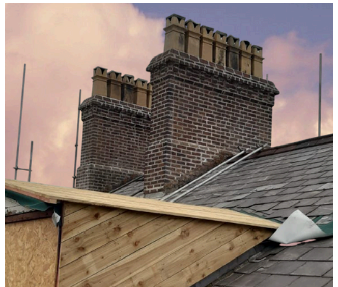
Dormer windows at the front of the building and also the finished chimneys.