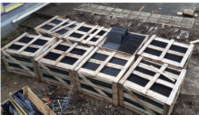
Slates ready to layed