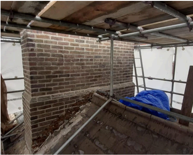
The repointing of the chimneys has been completed

This work is funded through the Welsh Government's Town Transformation fund. We are extremely grateful for the financial support that Menter y Tŵr has received.