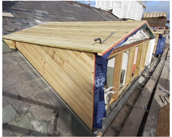
Renovated dormer windows