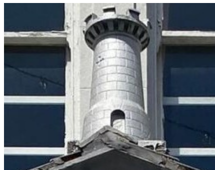
The tower above the entrance.