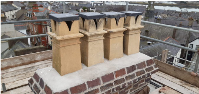
The chimneys have been capped.