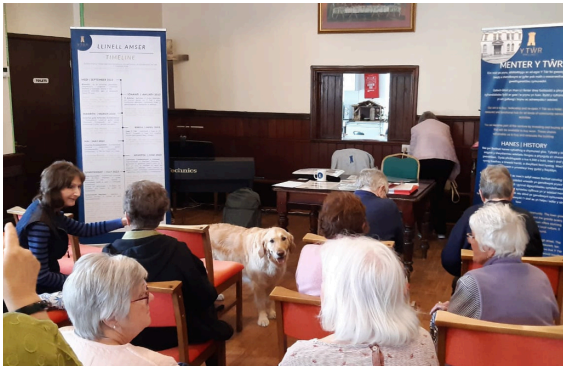
Wendy entertaining the group